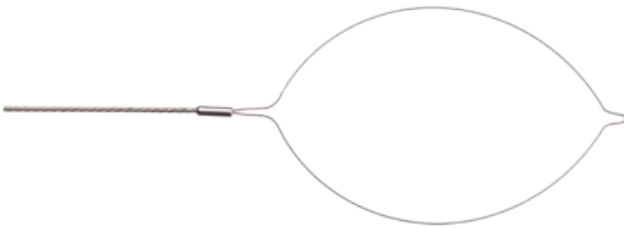
S - L(D)Ø - a x b sym