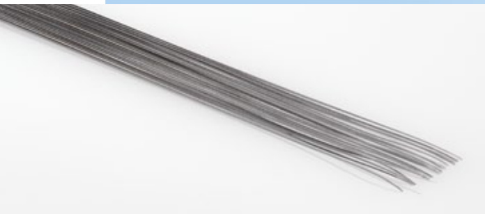
Ø - tw - x - l / Hypotube with skive