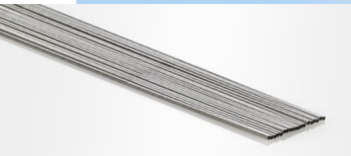
Ø - tw - x - l / Hypotube (laser cutting)